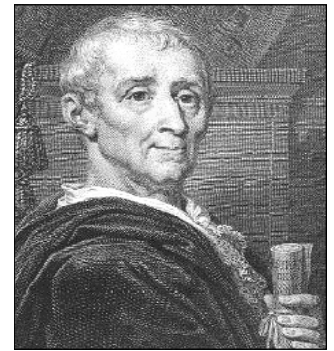
Baron de Montesquieu

Charles Louis de Secondat was born in 1689 in the city of Bordeaux, France. At age 27, he became Baron de Montesquieu (MON-teh-skew) when he inherited his uncle's fortune and title. Montesquieu was one of the great thinkers of the 17th and 18th centuries. He spent a lot of time thinking about how governments should be created and maintained. His ideas guided the Founding Fathers when they wrote the United States Constitution. Even today, Montesquieu's thinking influences the way people think about government around the world.