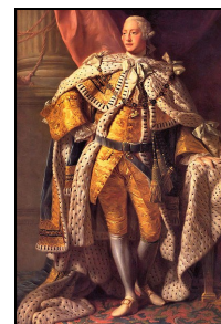
← King George III

Montesquieu studied the laws, customs, and governments of European countries to see how they created and enforced laws. He admired the government of England. The English government had three parts: a king to enforce laws, Parliament to create laws, and courts to interpret laws. The government was divided into parts, and each part had its own purpose. Montesquieu called this the separation of powers .