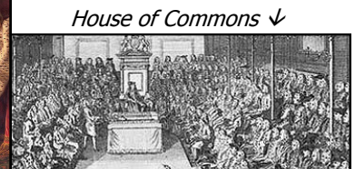
House of Commons ↓